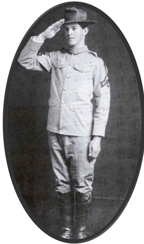
Figure 1 Cadet First Sergeant, Placer High School, Auburn, circa 1912

This Act was approved and signed into law by Governor Hiram Johnson on 5 April 1911, thus the beginning of the California Cadet Corps (then known as The California High School Cadets).