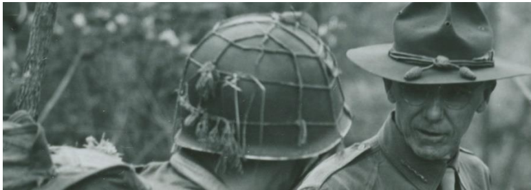
Figure 3 General "Vinegar Joe" Stilwell, Burma, circa 1943

demonstrated proficiency as a Cadet. Today, the award is usually given to the Overall Outstanding Cadet at the Corps State IMA competition.