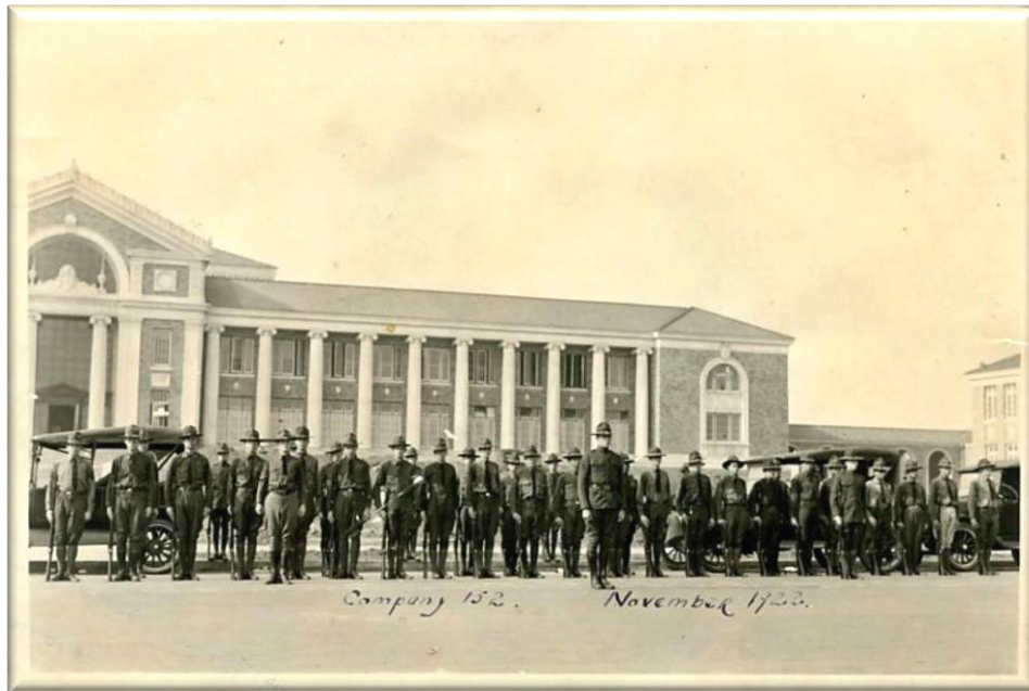
Figure 2 Cadet Company 132, Fresno H.S. 1922

The early years of the program saw growth in the northern and central part of the State. By the beginning of America's entrance in World War I in 1918, more than 7,000 Cadets had been trained. Moreover, out of those numbers 1,500 served in the Army, while 370 went into the Navy and 61 to the Marine Corps, netting 218 officers and 190 NCOs during the Great War. So much pride was held by the State Government for the program that in 1919 the State Senate passed a Resolution commending the program.