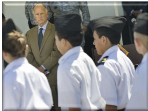
Figure 4 Gov. Jerry Brown watches as more than 1,000 cadets from middle and high schools throughout the state, march past at the California Cadet Corps Centennial Celebration Saturday in Los Alamitos

In 2011, the Corps celebrated its centennial. At Los Alamitos JTFB, great pomp and circumstance was given to celebrate the event. The Governor and advocate, Jerry Brown, was there to commemorate the milestone, stating to the crowd gathered, "People are having a hard time deciding what our common purpose is," he said. "I see in the California Cadet Corps the training of our future leaders who rise above their own selfish interests and think about the state and the country first. That's what leadership is about." In 2018, this forward movement continues to be championed by Governor Brown, a former California Cadet, that confirms we will be around in the future.