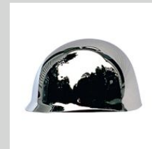
Units are authorized 5 helmets