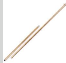
Units are authorized 3 poles.