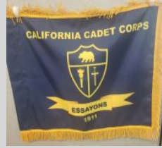
Units are authorized 1 flag.