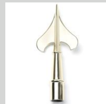
Units are authorized 5 spears