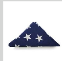
Units are authorized 5 US folding flags