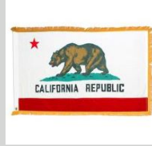
Units are authorized 1 flag.