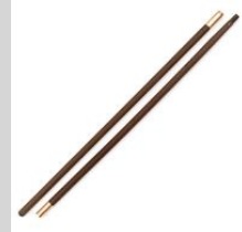
Units are authorized 3 poles.