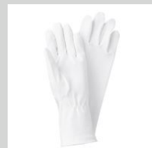
Units are authorized 6 pairs of gloves every school year