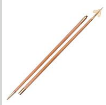
Units are authorized 1 pole.