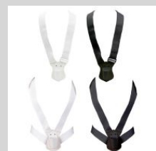
Units are authorized 3 harnesses.