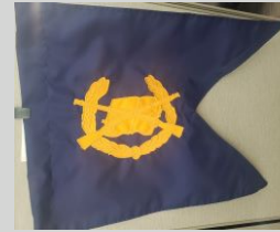
Units are authorized 1 flag.