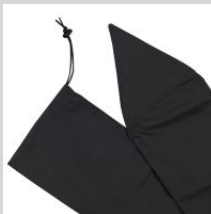
Units are authorized 3 flag covers.