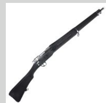
Units are authorized 12 drill team rifles.