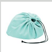
Units are authorized 5 bags