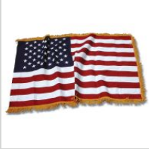
Units are authorized 1 flag.